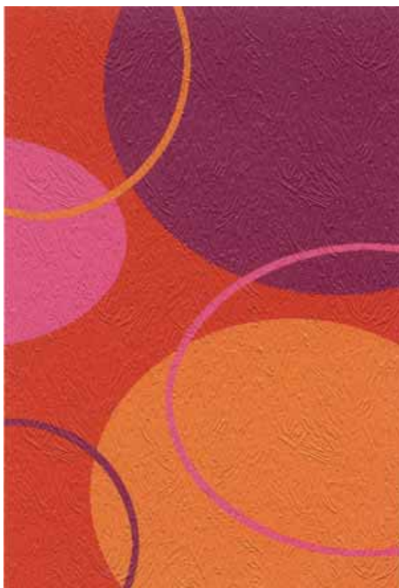
Ref. 6005/30 Dimensioni: cm 140x195 - 165x235