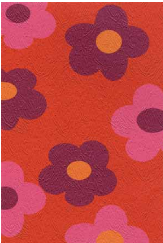
Ref. 6006/30 Dimensioni: cm 140x195 - 165x235