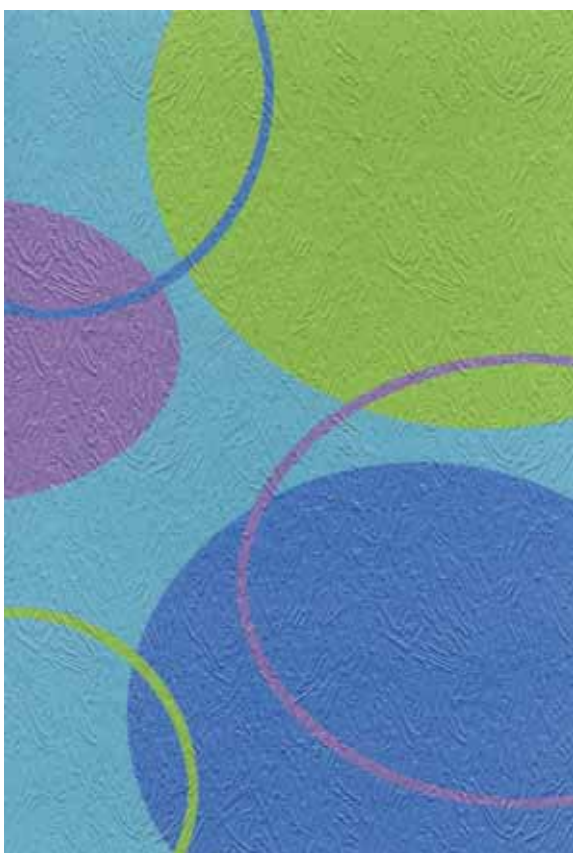
Ref. 6005/70 Dimensioni: cm 140x195 - 165x235